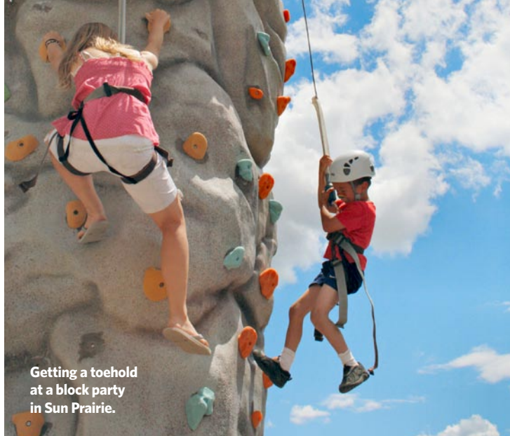
Getting a toehold at a block party in Sun Prairie.