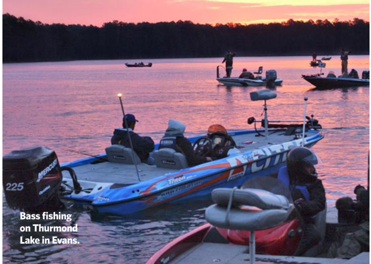
Bass fishing on Thurmond Lake in Evans.