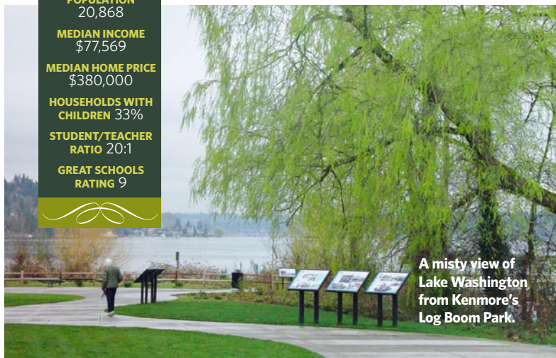
A misty view of Lake Washington from Kenmore’s Log Boom Park.

GOLD STAR Members of the New Scholar Society, a group of black honors students, serve as mentors to other African-Americans to improve performance and encourage them to enroll in AP classes. And senior citizens who volunteer to teach reading and math in Sun Prairie’s elementary, middle and high schools receive an annual stipend of up to $430, which they can use to reduce their property tax bills. ●