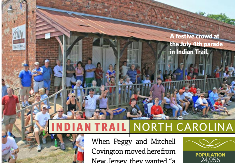
A festive crowd at the July 4th parade in Indian Trail.