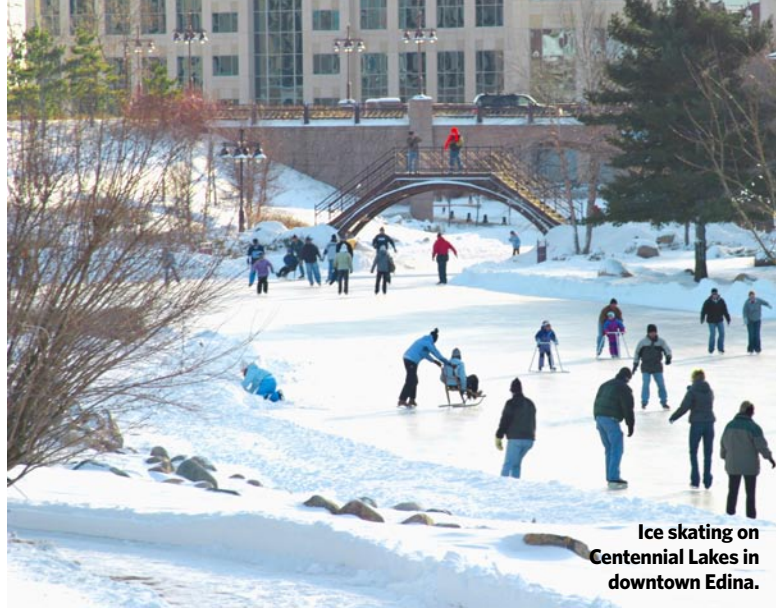
Ice skating on Centennial Lakes in downtown Edina.