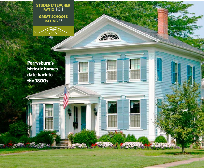
Perrysburg's historic homes date back to the 1800s.