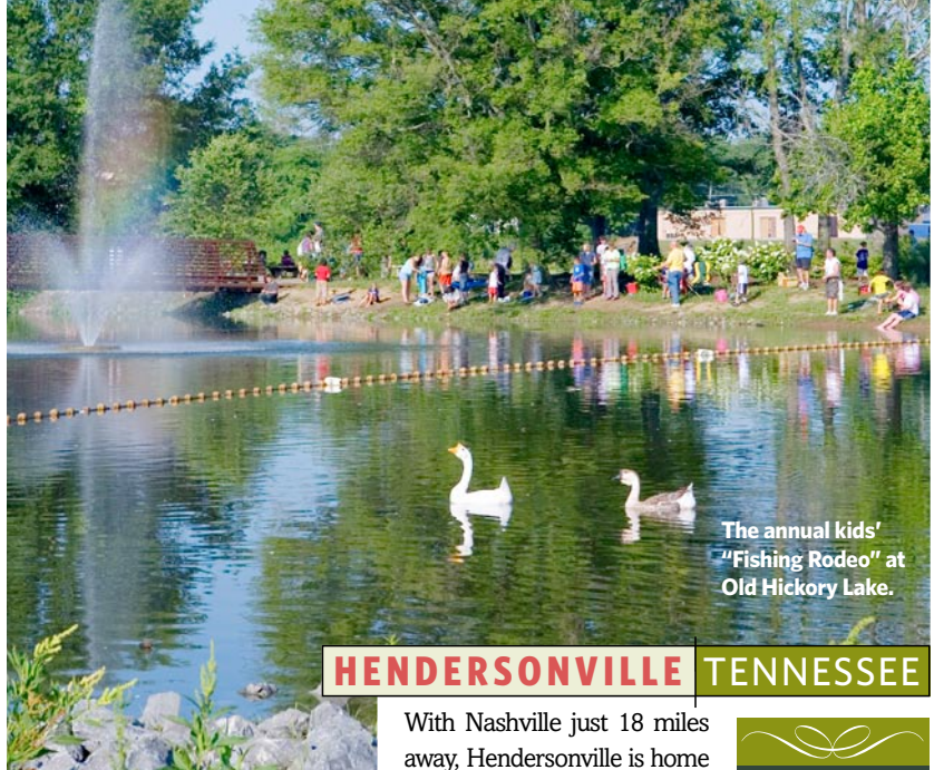
The annual kids' "Fishing Rodeo" at Old Hickory Lake.

GOLD STAR Lessons in compassion start early. Elementary school kids do service projects, like making meals for the elderly, every year. In 2008 first-through fifth-graders at one school raised $13,500 for the American Heart Association.